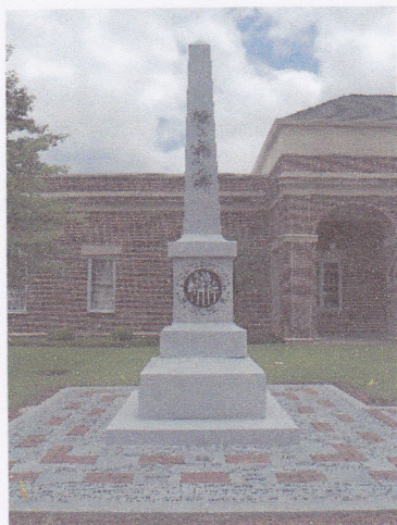
Monument for the 200th Anniversary of Emanuel County